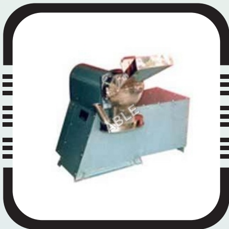
Stainless Steel Grinder