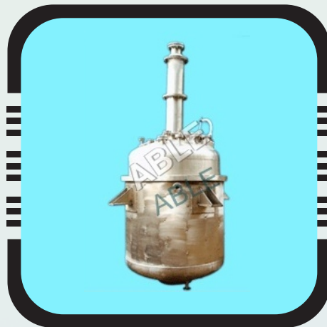
Spices Extraction Equipment