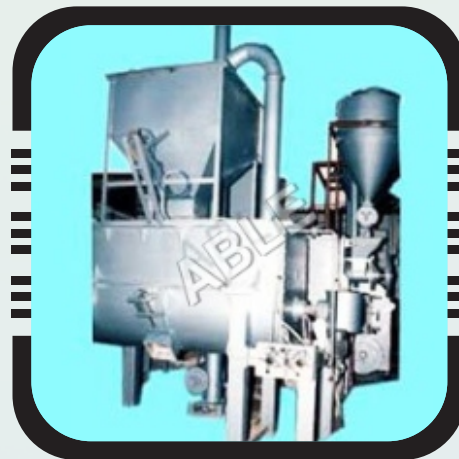
Automatic Chilli And Spices Powdering Plant