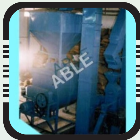
Poultry Feed Machine