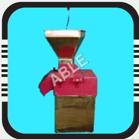
Food Processing Machine